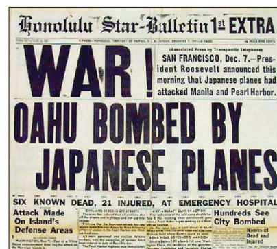
Newspaper Reporting Pearl Harbor Attack

In 1931, Japan was hit badly by the economic depression. Japanese people lost faith in the government. They turned to the army in order to find a solution to their economic problems. In order to produce more goods, Japan needed natural resources for its factories. The Japanese army invaded China, an area rich in minerals and resources. China asked for help from the League of Nations. Japan ignored the League of Nations and continued to occupy China and Korea. As Japan invaded other areas of South East Asia including Vietnam, the United States grew concerned about its territories in Asia, such as the Philippines and Guam. Japan felt that its expansion could be threatened by the United States military and attacked Pearl Harbor, Hawaii, in December 1941. World War II had begun in Asia.