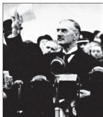
British Prime Minister Chamberlain holding up the Munich Peace Agreement Source: http://www.historyonthenet.com/WW2/causes.htm#agreement with Hitler in 1938